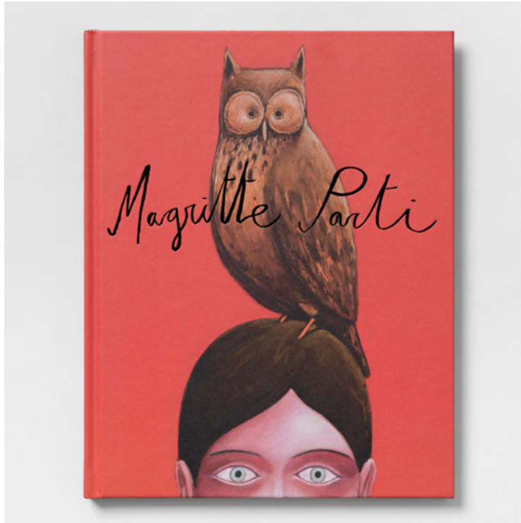
Magritte Parti . Courtesy of Xavier Hufkens.