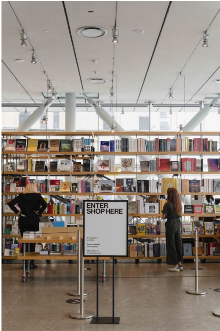
( https://news.artnet.com/app/news-upload/2020/11/medium_whitney20_reopening-866_retouched.jpg )